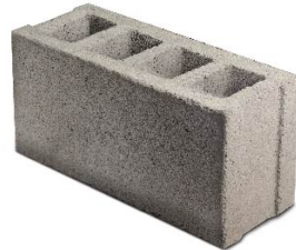
L: 390mm x W: 150mm x H: 190mm (6" x 8" x 16")