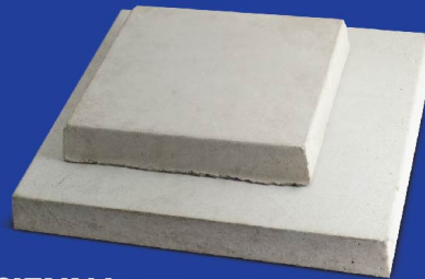
SIENNA SLAB (300 x 300 x 50 mm) CLASSIC SLAB (450 x 450 x 50 mm)