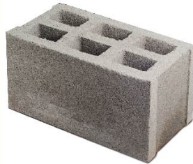
L: 390mm x W: 200mm x H: 190mm (8" x 8" x 16")