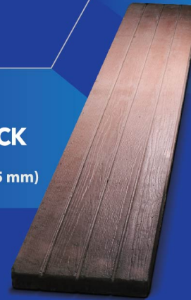
TIMBER DECK (DARK BROWN) (1800 x 125 x 125 mm)