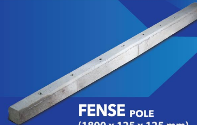
FENSE POLE (1800 x 125 x 125 mm)