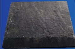
ROCK TILE (300 x 300 x 50 mm)