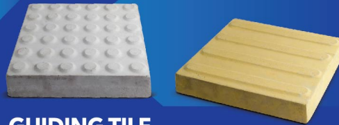
GUIDING TILE / TACTILE ROUND (300 x 300 x 50 mm)

Lumbiniwatta, Habarakada Road, Ranala Tel : 011 5926240