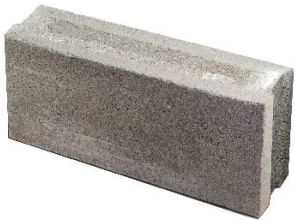
L: 390mm x W: 100mm x H: 190mm (4" x 8" x 16")