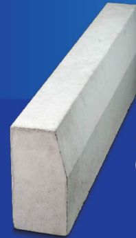
HALF CURB (450 x 125 x 255 mm)