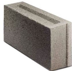
L: 390mm x W: 150mm x H: 190mm (6" x 8" x 16")