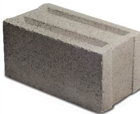
L: 390mm x W: 200mm x H: 190mm (8" x 8" x 16")

SMS Holdings are the most trusted name of the industry with SLS/ISO Certification for Solid & Cellular cement blocks since 2001.