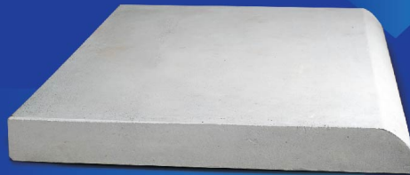
COFFIN SLAB ( 900 x 600 x 100 mm)