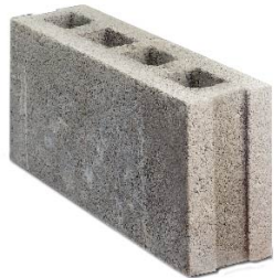
L: 390mm x W: 100mm x H: 190mm (4" x 8" x 16")